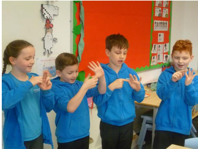
Talk for Writing in action