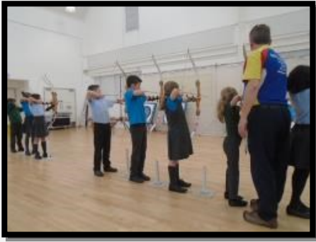
Learning about forces